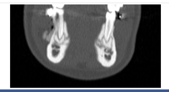
Figure 2: CBCT coronal sections shows a lesion with both radiopaque and radiolucent features with well- defined border that did not compromise the buccal and lingual plates.