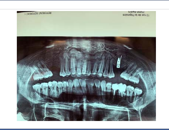
Figure 10: Clinical and panoramic view of implant procedure: The augmented bone remains stable during implant placement the osteosynthesis screw was broken during her removal without any pathological incidence.