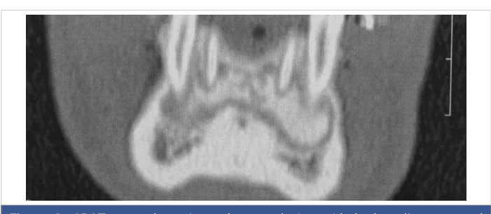
Figure 3: CBCT coronal sections shows a lesion with both radiopaque and radiolucent features with well- defined border that did not compromise the buccal and lingual plates.

patient refused the biopsy after becoming aware of the risks associated with this biopsy (dental root lesions, post-operative infection, lesions may be quite vascular and bleeding can be brisk) [30]. CBCT images demonstrate the pathognomonic appearance of fibrous dysplasia. Twenty for month later at follow up CBCT examination, no difference was noticed in the imaging findings. An MRI of the pelvis and the long bones was carried out to rule out a polyostotic fibrous dysplasia.