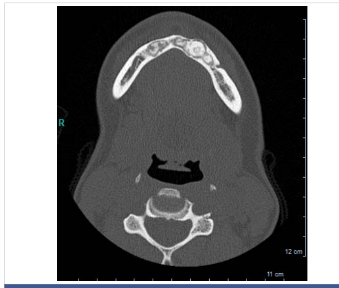
Figure 1: CBCT axial scan shows a massive radiopaque lesion of the anterior mandible, which a ground glass appearance, confined between the both premolars area without increasing the mandibular body.

CBCT axial scan shows (Figure 1) a massive radiopaque lesion of the anterior mandible, which a ground glass appearance, confined between the both premolars area without increasing the mandibular body. CBCT coronal sections shows (Figure 2) a lesion with both radiopaque and radiolucent features with well- defined border that did not compromise the buccal and lingual plates (Figure 3). The