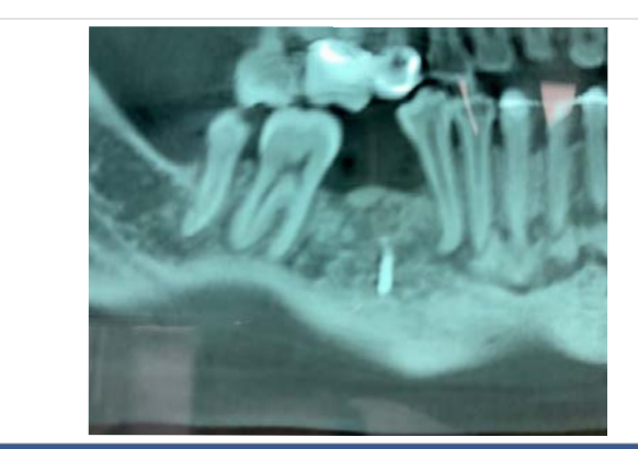
Figure 8: Alveolar bone width assessed at six months using coronal and panoramic CBCT images prior implant placement: the new bone is formed without prior resorption. The block graft was clinically well integrated into the defect site. No other clinical problem was observed.