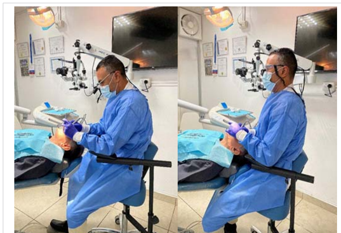
Figure 5: Postural Comparison between a non-customed conventional loupes selection vs. customized ergonomic magnification loupes.