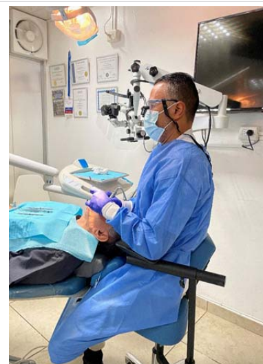
Figure 1: Neutral Seated Posture with ergonomic magnification loupes.