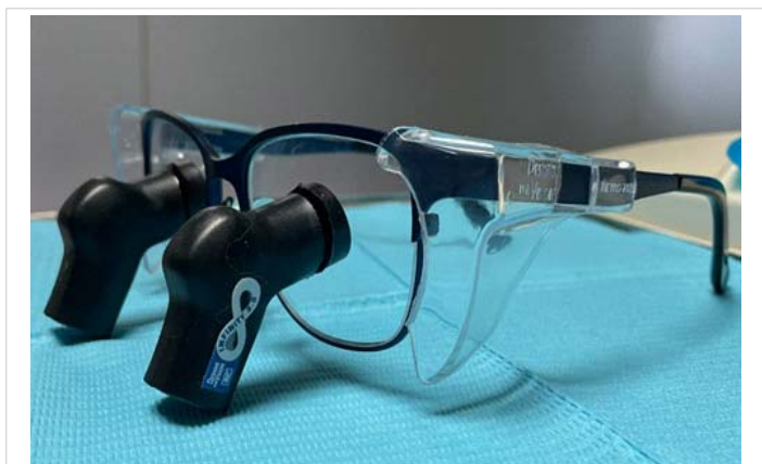
Figure 4: Ergonomic Magnification Loupes.

However, the most significant disadvantage of the dental microscope is the high initial investment cost and the more complex and often lengthy learning curve, even more without adequate training in its use [28]. The ergonomic magnification loupes can represent a significantly cheaper portable alternative, with the postural benefits for the operator and also a potential leap to jump to a higher magnification with all the benefits of the dental microscope with time [29-31] (Figures 4-6) (Table 1).