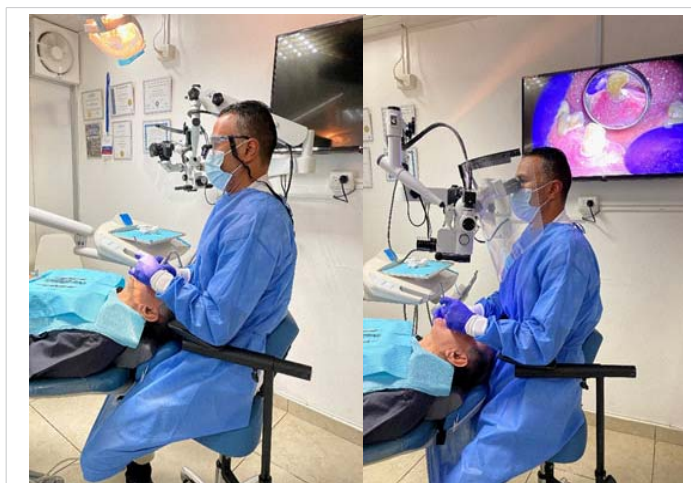
Figure 6: Postural Comparison between a customized ergonomic magnification loupes and the dental microscope, both promoting neutral body posture.