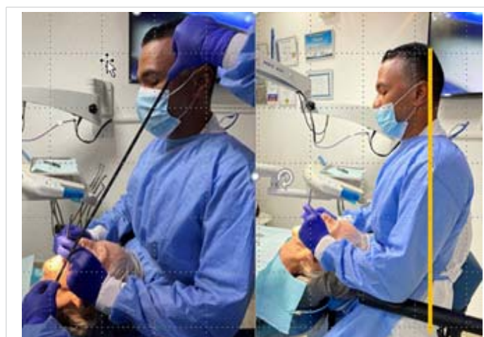
Figure 2: Measurement of the working distance.

Proper lighting, in addition to the power of magnification,