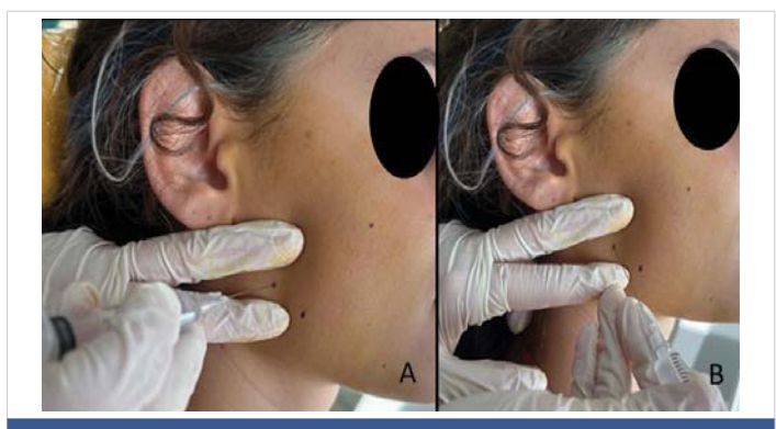
Figure 1: A,B: Trp lidocaine injection