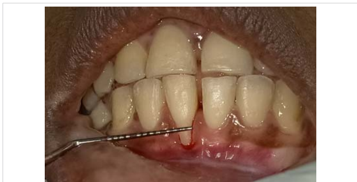
Figure 6: Recession Width of 3mm