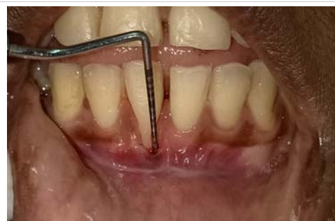
Figure 5: Recession Height of 6mm.