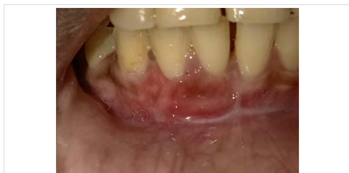
Figure 13: 3 Months postoperative image showing complete root coverage.

In this presented case single isolated recession is due to shallow vestibular depth. Hence, vestibuloplasty was done before root coverage procedure. Studies about percentage of root coverage obtained using various techniques resulted that connective tissue graft along with coronally advanced flap has the highest success rate is about 88% to 98% [6,7]. In the present case scenario there was inadequate keratinized