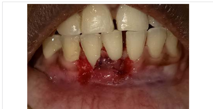
Figure 10: Lateral Pedicle Graft placed over the Connective Tissue Graft and sutured using 5-0 Vicryl suture material.