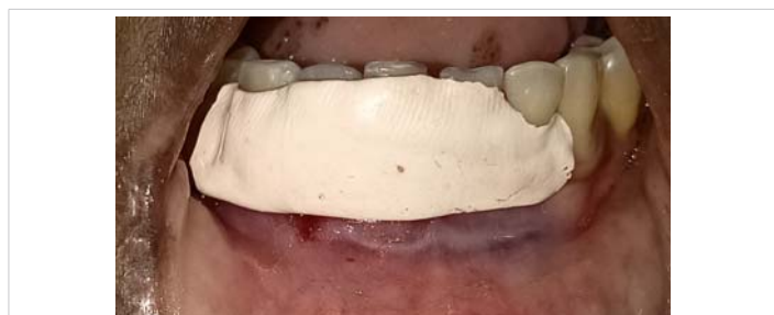
Figure 11: Periodontal dressing placed over the surgical site.