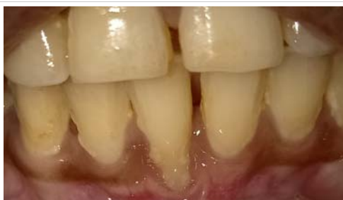
Figure 1: Miller's Class II Recession in 41.

There are greater reduction in gingival recession and gain in keratinized tissue when using autogenous connective tissue grafts [4,5]. The surgical technique that is used to treat a recession site depends upon various factors that include the anatomy of the site, width and height of the adjacent keratinized tissue, size of the recession defect, vestibular depth and presence of frenum. Gingival recession may be caused due to many etiological factors. Eliminating the causative factor for the defect should be of priority during treatment planning.