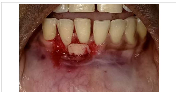
Figure 9: Connective Tissue Graft placed over the exposed root surface.