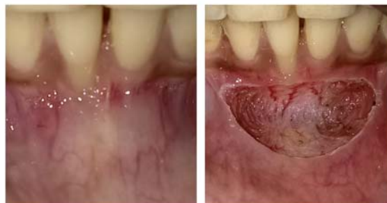
Figure 2: Vestibuloplasty done using 940 nm Diode LASER.