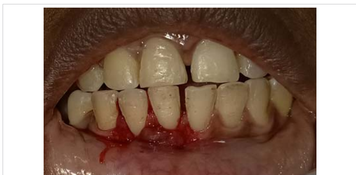
Figure 7: Lateral Pedicle Flap reflected from 42.