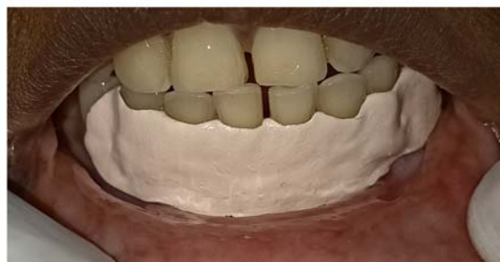
Figure 3: 4 Weeks post operative image after Vestibuloplasty.