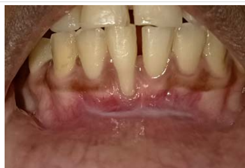
Figure 4: Pocket Depth of 1mm.