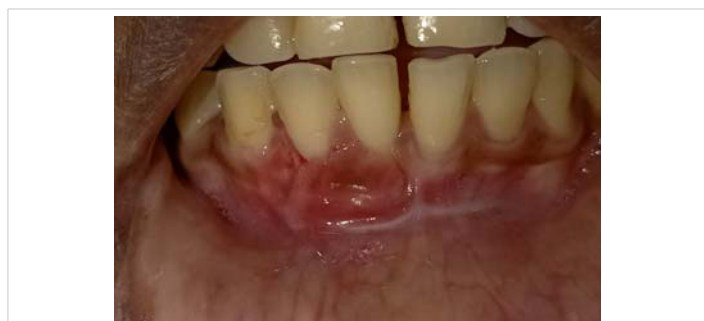
Figure 12: 1 week Postoperative image showing good healing.